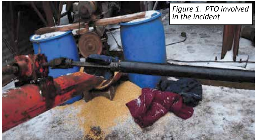
Figure 1. PTO involved in the incident